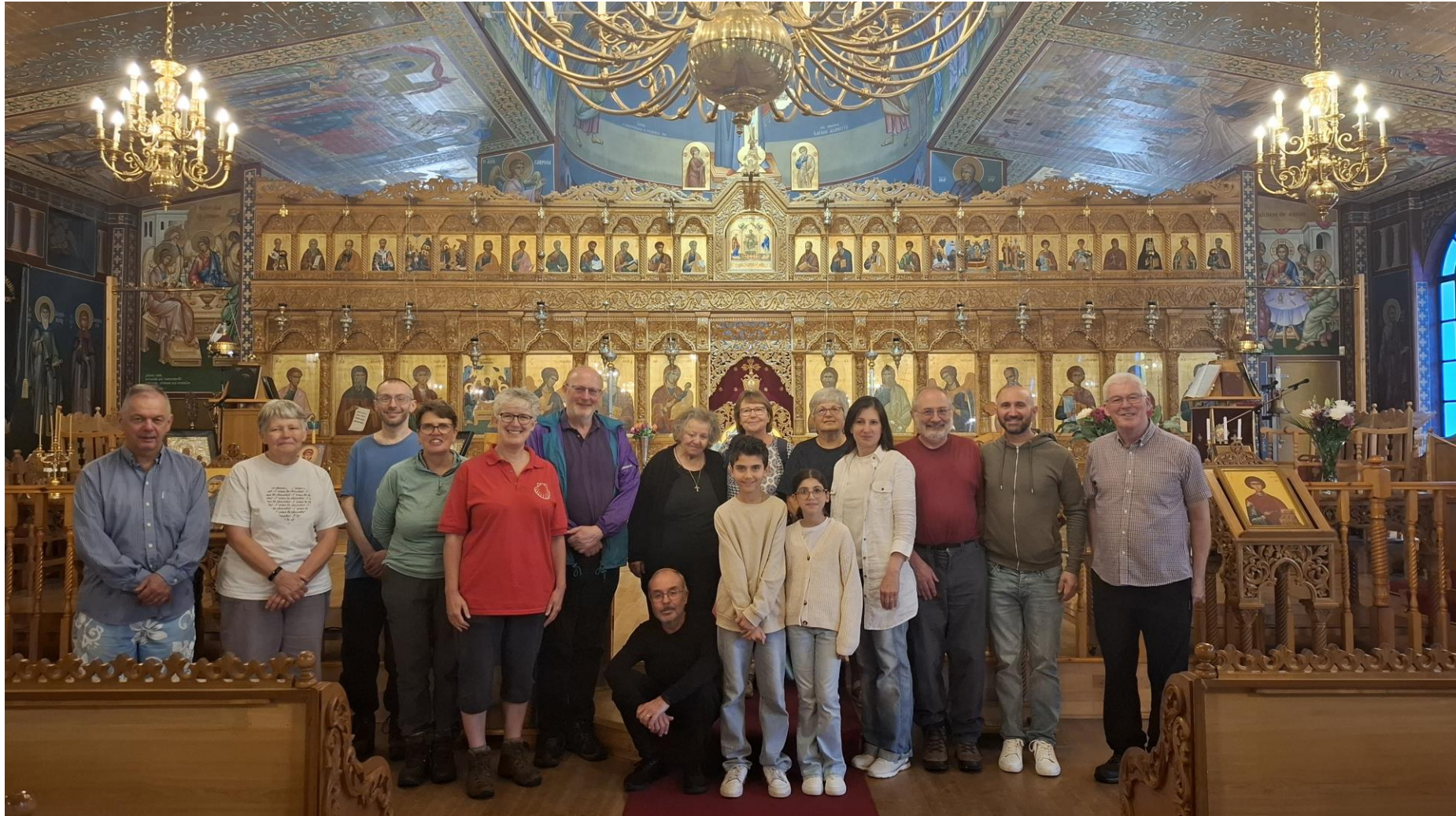
NICAEA 1700, LICHFIELD TO BOURNVILLE, 28 – 30 JULY 2025