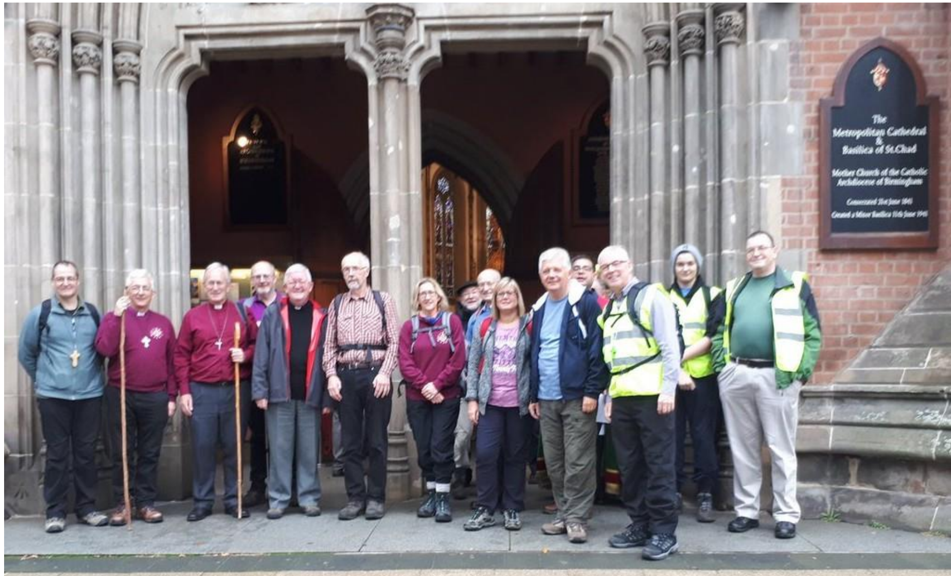
Senior Church leaders leaving St Chad's Cathedral, Birmingham, 23 September 2017