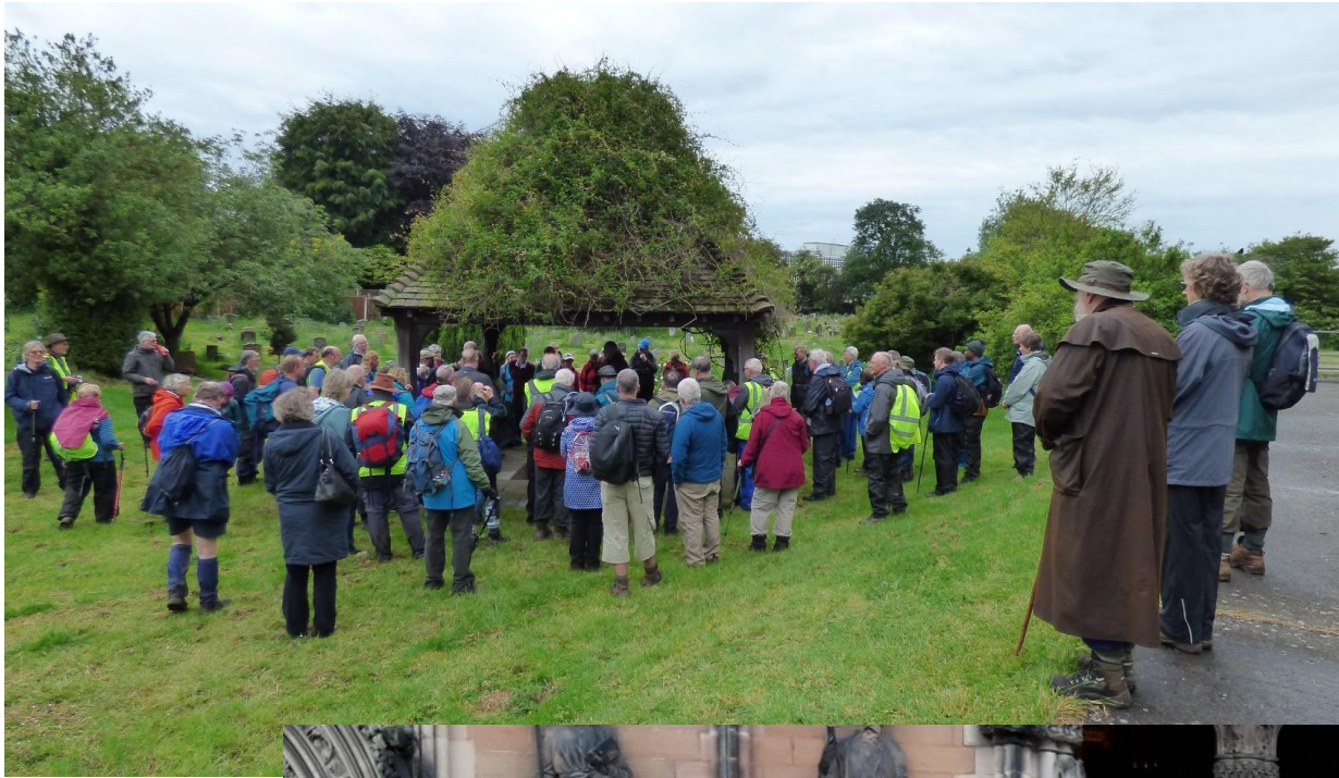
St Chad's Well (left) Lichfield Cathedral (below)