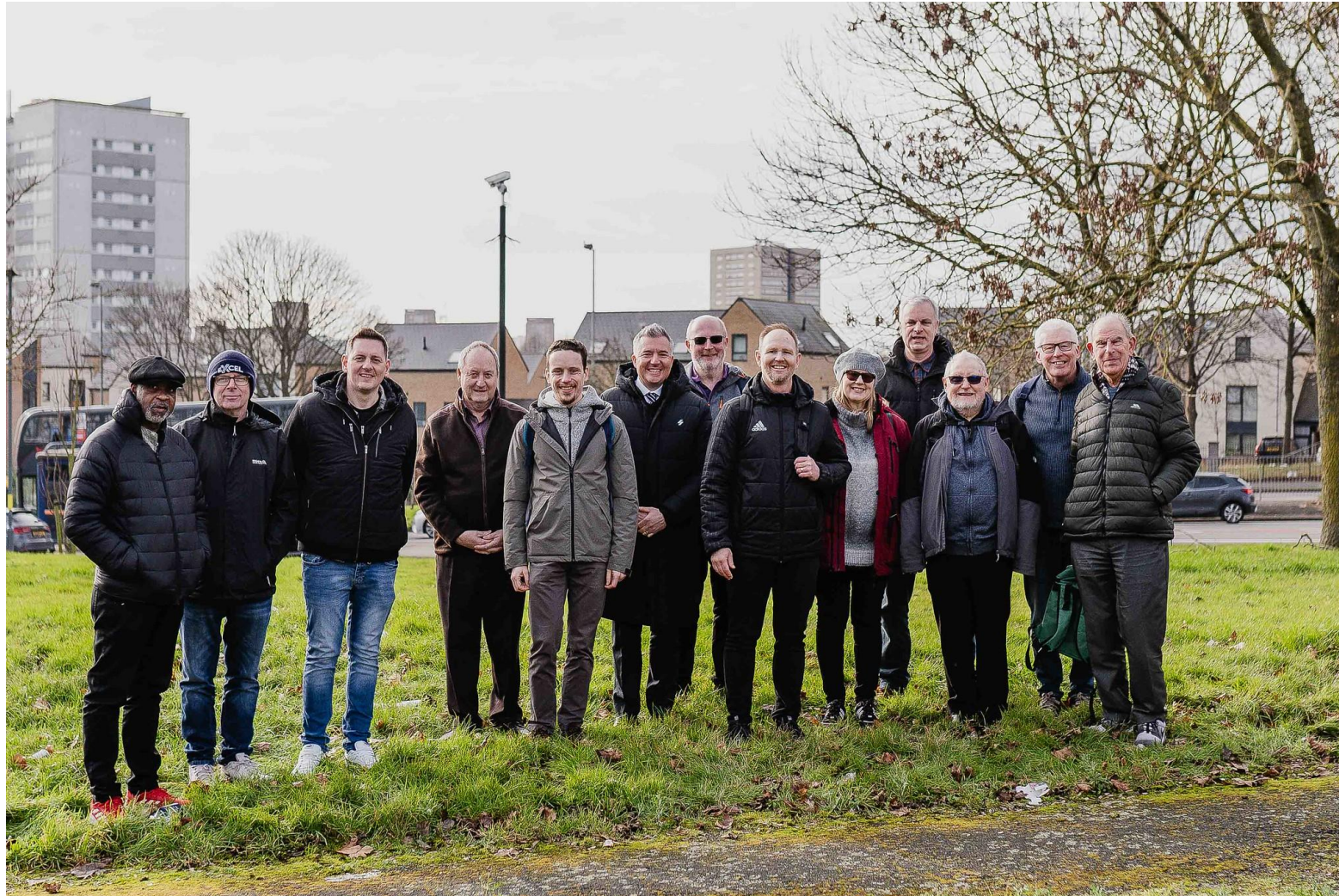
CENTENARY OF FORMATION OF ASSEMBLIES OF GOD ASTON, BIRMINGHAM, 1 FEBRUARY 2024