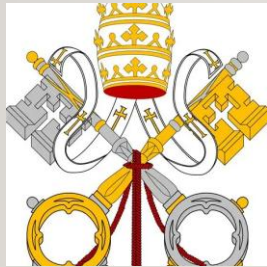
Second Vatican Council: “Nostra Aetate”