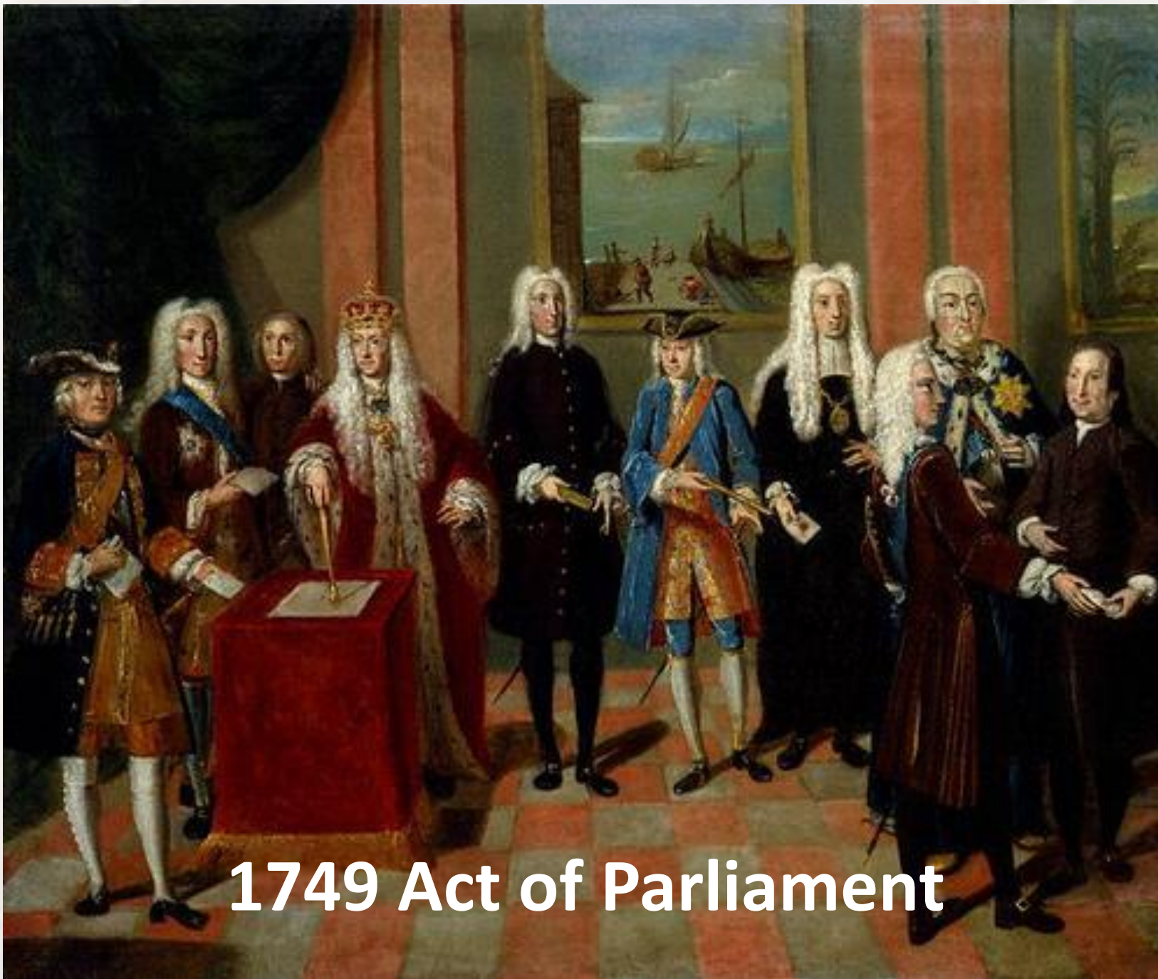
1749 Act of Parliament