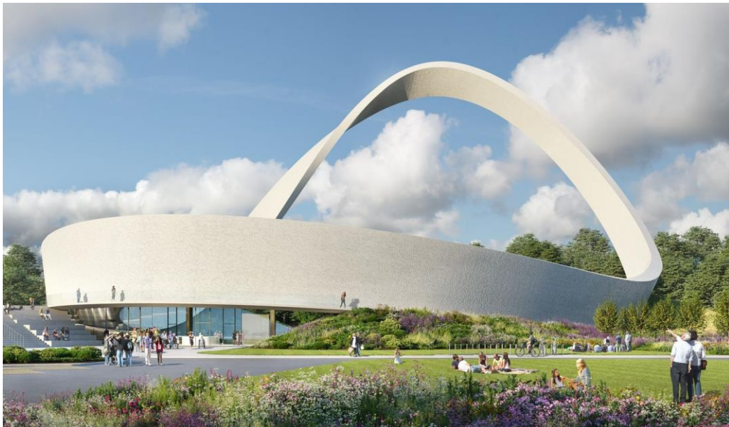
Photo credit: CGI created by Renderloft, designed by Snug Architects

It is intended that building work commence in Spring 2021, with completion in late 2022. When opened, the 'Eternal Wall of Answered Prayer' is expected to attract 300,000 visitors each year. Those visiting the site will be welcomed at a visitor centre, complete with bookshop and cafe. Visitors will be able to walk around the wall, which will consist of one million bricks, each one of which will host a story of answered prayer. The stories on each brick will become visible through mobile phone technology.